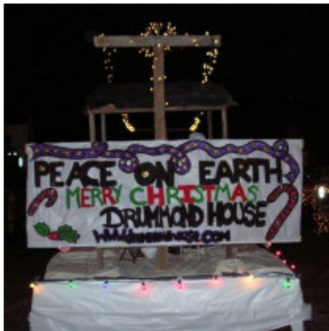
Right: Christmas tree featured at the Christmas Tour Open House.