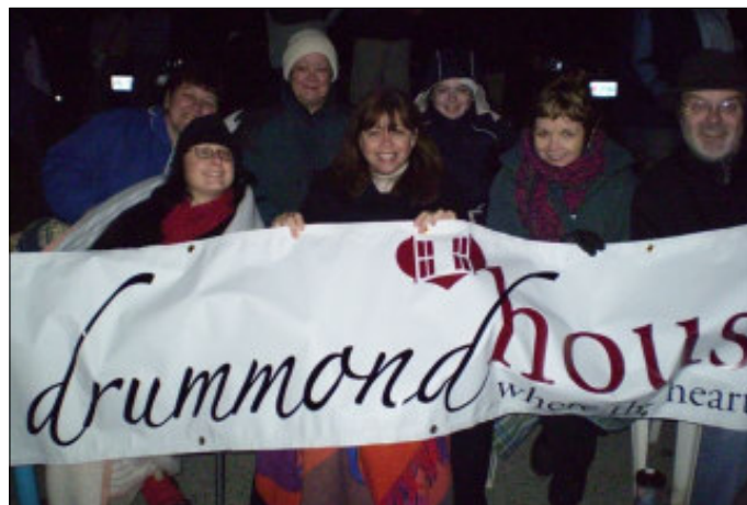
Residents and staff at the Waterdown Christmas parade.