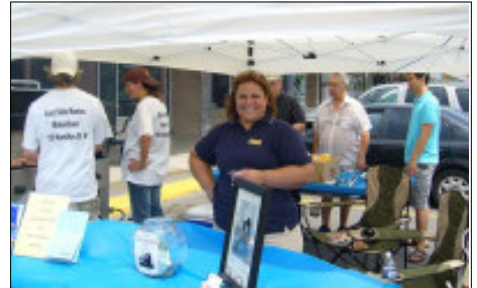
Duca Financial Fundraising Barbecue.