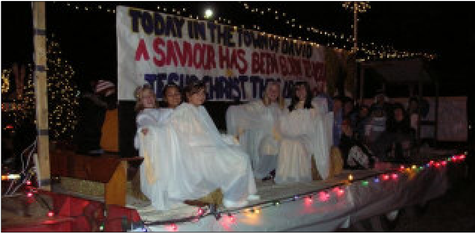
Above & Below: Drummond House participated in the Waterdown Christmas parade as a thank you to the community for all their help.