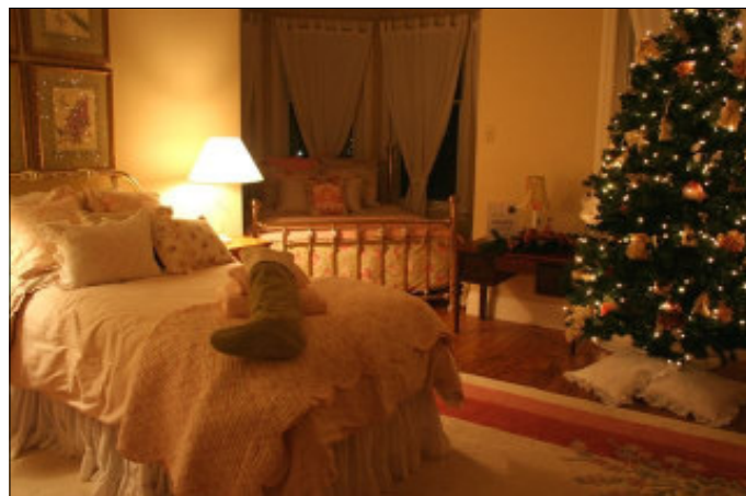
Open House: room decorated by "Nesters" of Campbellville.