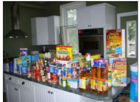
"Lady of Mount Carmel" food drive.